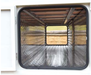
Another under floor storage area that runs the full width of the truck, ideal for portable yards/stables.