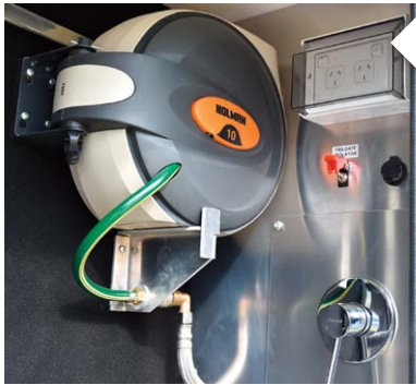
The retractable hose for the hot/cold wash is housed in the tack box. The stainless steel tap is just below the reel and there are two protected power points for external use.

With all the Dream Rigs we talk about the power system be it 12/240 gas, solar and generator that are dealt with individually. Well, not in this Wade Equine Coach which has Mastervolt C Zone System and we are talking advanced electrical engineering. It involves a wireless interface that allows you to use your iPad to interface with the on board switching system for full monitoring and control of the electrical equipment. In effect you never need to plug into mains power. "We want to be independent," says Trelise, "we don't want to have to go and look for a power source. We use lithium ion batteries and they go from flat to fully charged in two hours and are so much better than the open cell batteries and the lithium batteries need no maintenance." We photographed the McBains' coach just a couple of days after it arrived off the boat from New Zealand. The Volvo FE came straight from the factory in Sweden to New Zealand. This vehicle is the ultimate in European luxury and design, the detail is perfect and the quality of the fixtures and fittings as good if not better than you would find in a luxury home. This is a real Dream Rig and you have to be dreaming big.