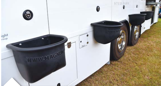
Rubber feed bins attach to the side of the truck.