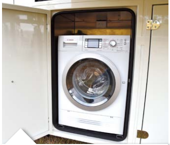
A Bosch washer/dryer is fitted into one of the external boxes.