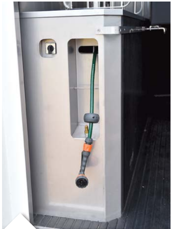
The hose attached to the reel in the tack box comes out on the side of the chest box just at the top of the loading ramp. There is a hose attachment as well as a Gerni attachment for cleaning out the back of the truck.