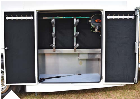
The spacious tack box.