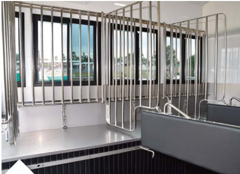
The combination of stainless steel and rubber is easy to maintain and will not rust. The padded partitions are easy to open and adjust. Stainless steel head dividers and bars on the large opening windows keep everyone safe but sociable.