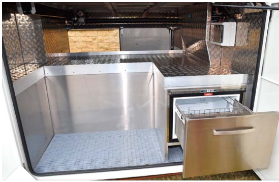
There is plenty of under floor storage for hay, feed rugs or whatever, even a motorbike. The outdoor fridge for ice boots and / or refreshments can be seen at the bottom right hand corner of this photo. All boxes on the coach are of course lockable.