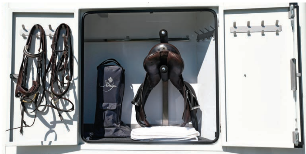
The tack locker is situated at the back of the truck. It's easily accessible and has more than enough room for Steph's gear.