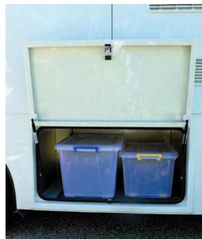
Yet more storage. It's not possible to have too much storage when travelling horses.