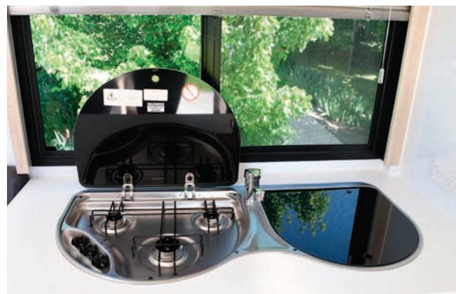
The three burner gas hob. There is also LED lights throughout.