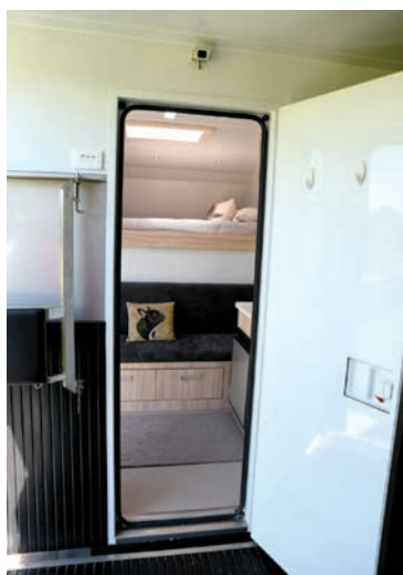
The view from the horse section in to the living area. The living comes with a dining table, but so far Steph has set a table up in the horse section which works well and leaves more room in the living. The horse section is also a bathroom and dining room.