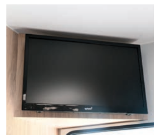
The flat screen TV is positioned above the living entrance. As well as over the bed, there is also a three way skylight in the compact, but stylish living area.