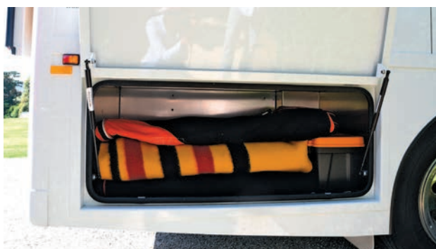
Plenty of rug storage, this time on the driver's side of the vehicle.

There is plenty of below stairs storage and this box on the left hand side of the vehicle holds the two 12 volt batteries that run much of the living, as well as the hydraulic switch to raise and lower the body of the truck in order to service the engine.