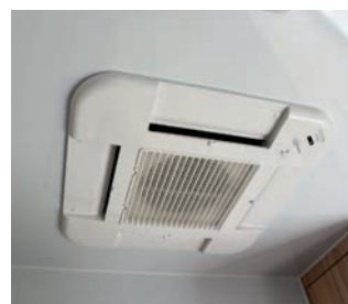
The Aircommand Ibis 3 air conditioner/heater has the lowest rooftop profile of any air conditioner on the market. This can be a real plus under some country bridges.