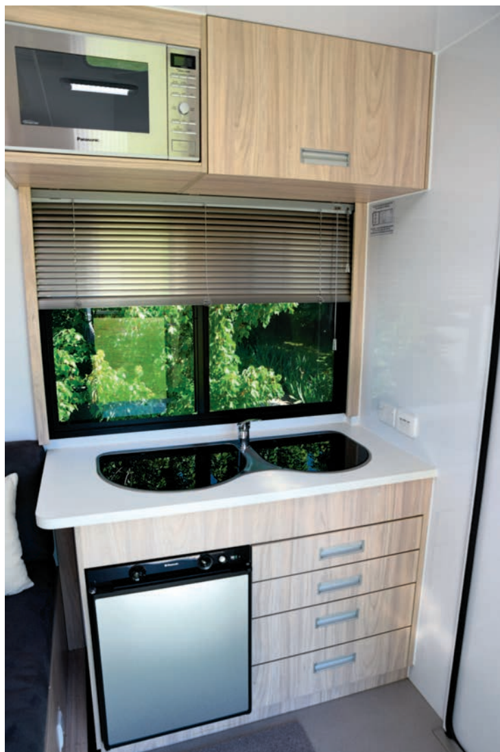
The well designed kitchenette has it all. The gas hob (on the left) and sink have a cover that provides a generous amount of bench space. The three way fridge (12/240v and gas) is located under the bench and even the drawers are easy glide. The microwave above completes the well appointed kitchen.