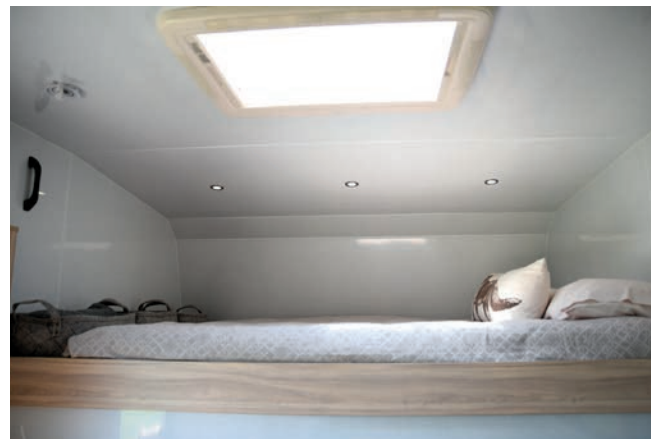
The queen sized bed in the luton is bathed in light thanks to the three way skylight. Open to the air with insect protection, shaded and totally closed. There is also plenty of storage at the foot of the bed.