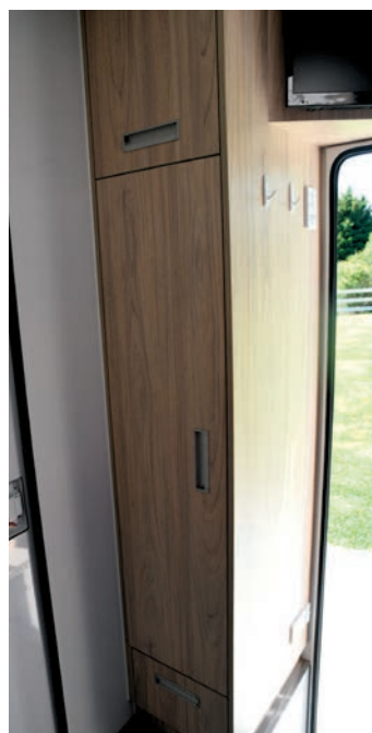
The wardrobe for hanging jackets.