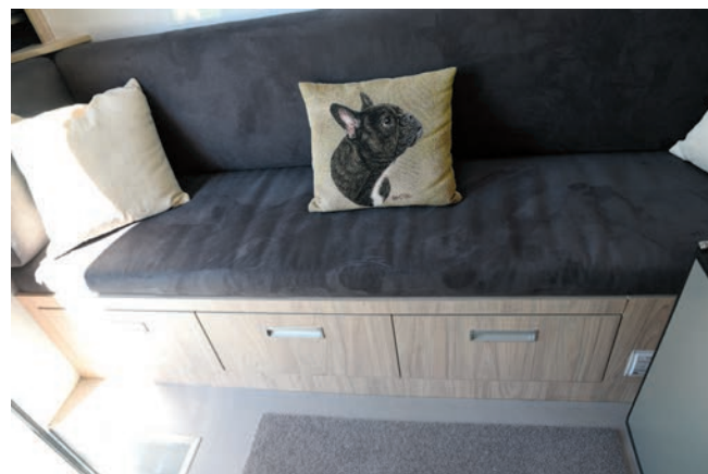
The sofa with plenty of storage below to stow the linen etc.